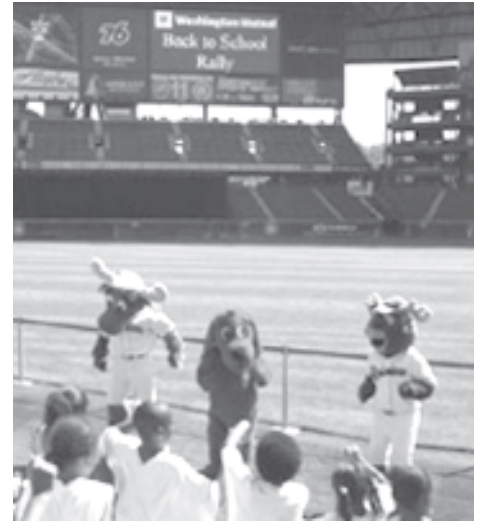
Clifford, the Big Red Dog, representing Page Ahead at the Mariner’s back-to-school rally.