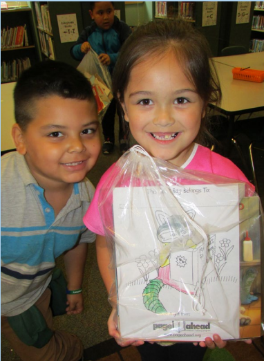
Right: Thorndyke students celebrate their Book Up Summer selections in 2019

Book Up Summer , our book fair–based summer reading program, builds home libraries and fights “summer learning slide” for K–2 students by letting them select 12 brand-new books at no cost to them every spring.