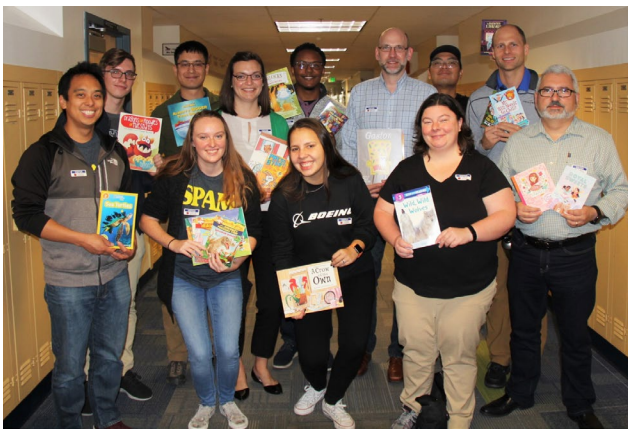
Volunteers from Boeing making a difference at Hawthorne Elementary in Everett in 2019

Last year, corporate matches of donations and volunteer time covered the cost of 1,450 students participating in Book Up Summer. That’s 17,400 more books on kids’ shelves! Not sure if your employer matches gifts? Check with HR or your online employee portal; you could double your impact!