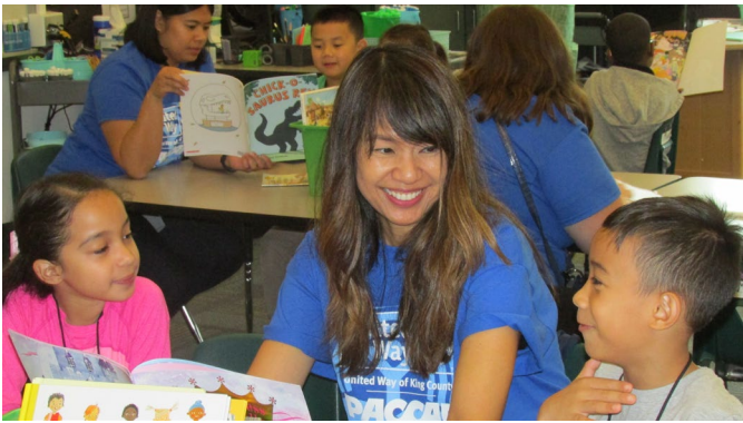
PACCAR volunteers pitching in at a Page Ahead reading event at Thorndyke Elementary in 2019

In the last 23 years, Thorndyke readers have gotten 27,707 books from Page Ahead—and that’s all been possible thanks to donors like you!