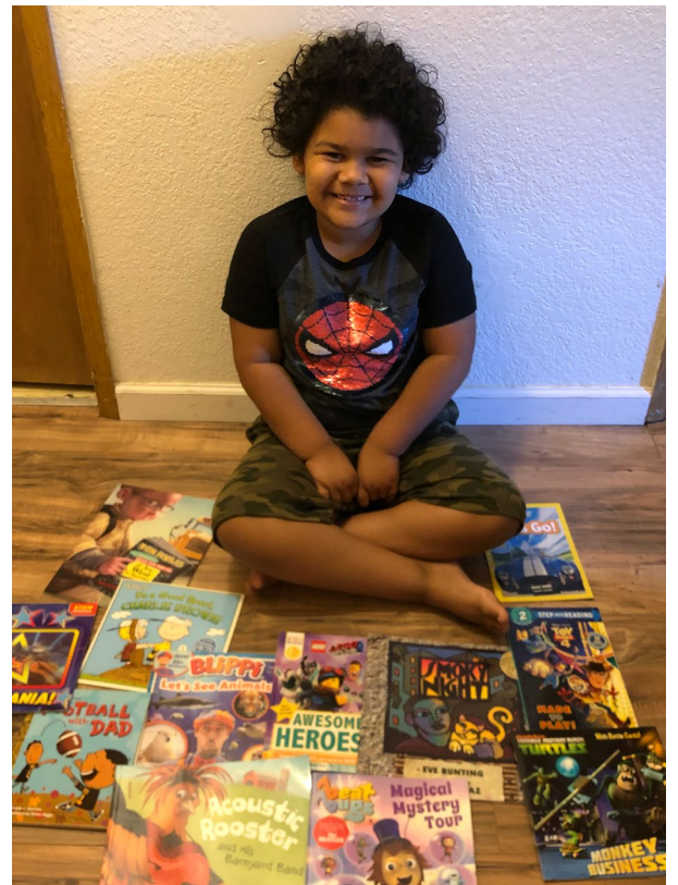
You built this home library for this Tacoma kindergartner—and his baby brother!

And your support didn't only provide books for just one child in that Tacoma family: "He also has a new baby brother born on June 1, 2021. He's excited to read all his new books to him. That bonding time will be priceless!"