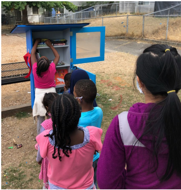
Young readers line up at a Book Oasis in September 2021

saw the shelves were full of new books, they all gathered around, four deep, very impatiently waiting their turn to get up to the shelves to pick out a book to take home!”